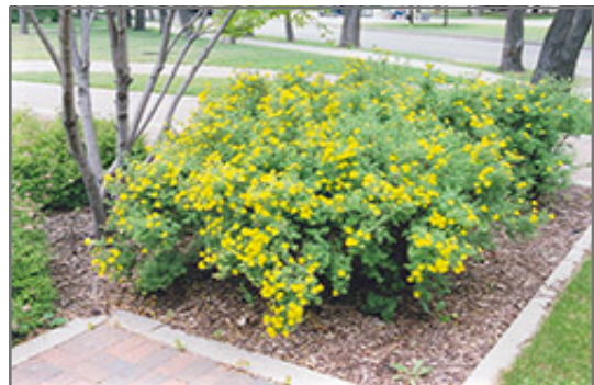
Coronation Triumph Potentilla in bloom