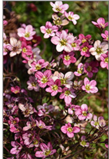
Purple Robe Saxifrage flowers