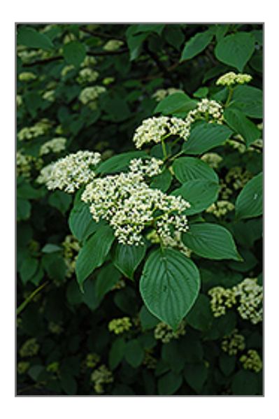
Pagoda Dogwood flowers

Pagoda Dogwood is recommended for the following landscape applications;