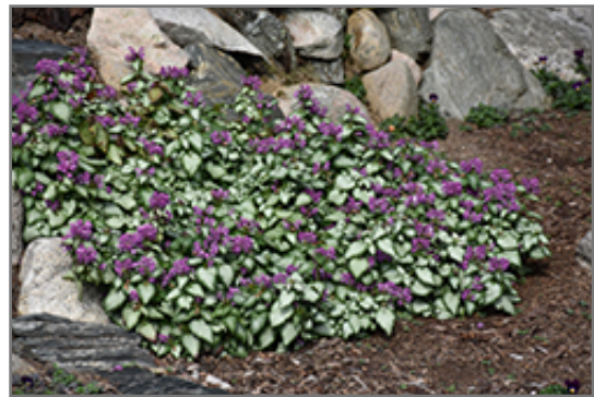
Purple Dragon Spotted Dead Nettle in bloom