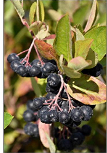
Viking Chokeberry fruit

This shrub should only be grown in full sunlight. It is an amazingly adaptable plant, tolerating both dry conditions and even some standing water. It is not particular as to soil type or pH, and is able to handle environmental salt. It is somewhat tolerant of urban pollution. This particular variety is an interspecific hybrid.