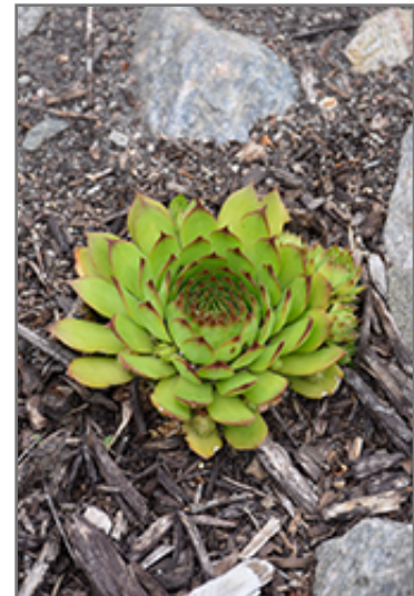
Sunset Hens And Chicks