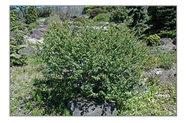
Arctic Birch