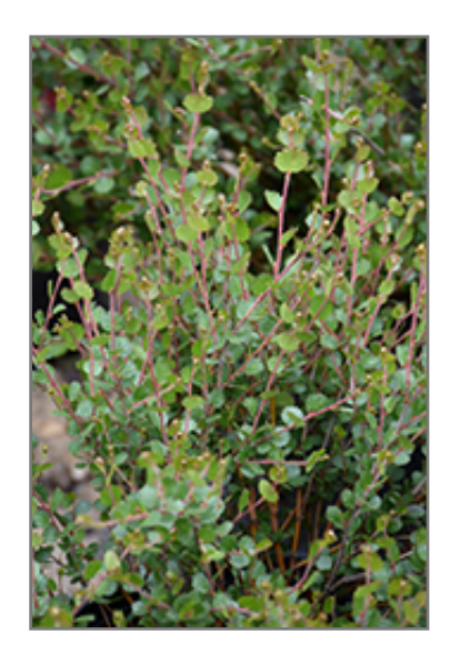
Arctic Birch foliage