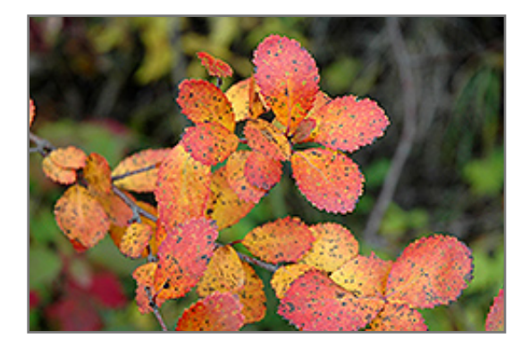
Arctic Birch in fall

This shrub does best in full sun to partial shade. It is quite adaptable, prefering to grow in average to wet conditions, and will even tolerate some standing water. It is not particular as to soil type or pH. It is highly tolerant of urban pollution and will even thrive in inner city environments. This species is native to parts of North America.