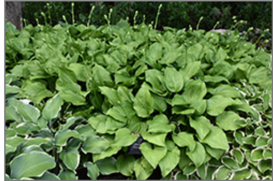
Royal Standard Hosta

Royal Standard Hosta is recommended for the following landscape applications;