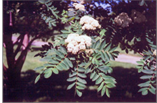
Showy Mountain Ash flowers

This tree should only be grown in full sunlight. It is very adaptable to both dry and moist locations, and should do just fine under average home landscape conditions. It is not particular as to soil type or pH. It is highly tolerant of urban pollution and will even thrive in inner city environments. This species is native to parts of North America.