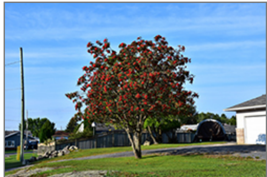
Showy Mountain Ash fruit