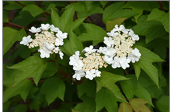
Redwing Highbush Cranberry flowers

Redwing Highbush Cranberry is a dense multi-stemmed deciduous shrub with an upright spreading habit of growth. Its average texture blends into the landscape, but can be balanced by one or two finer or coarser trees or shrubs for an effective composition.