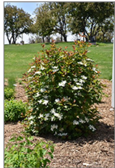
Redwing Highbush Cranberry in bloom