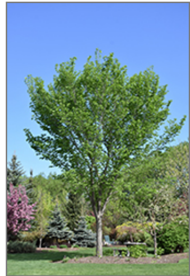
Brandon Elm