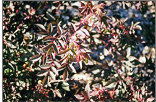
Red Leaf Rose foliage

This shrub should only be grown in full sunlight. It does best in average to evenly moist conditions, but will not tolerate standing water. It is not particular as to soil type or pH. It is highly tolerant of urban pollution and will even thrive in inner city environments. This species is not originally from North America.