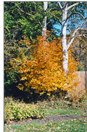
Saskatoon in fall