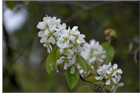
Saskatoon flowers Photo courtesy of NetPS Plant Finder

Saskatoon is a multi-stemmed deciduous shrub with an upright spreading habit of growth. Its relatively fine texture sets it apart from other landscape plants with less refined foliage.