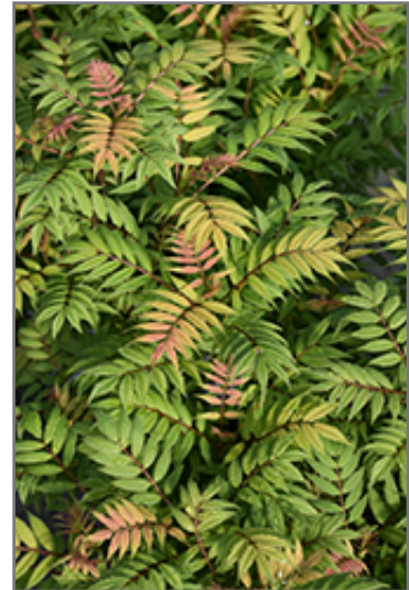
Mr. Mustard False Spirea foliage