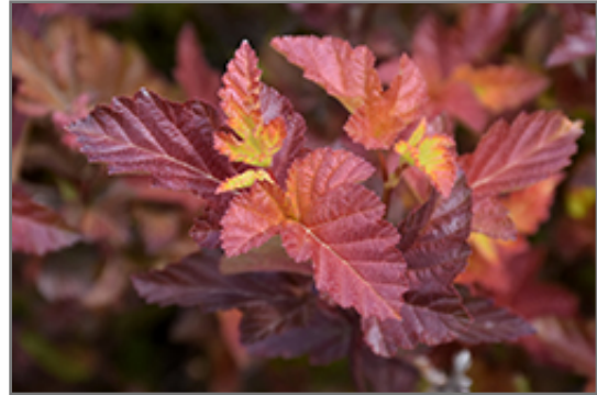
Center Glow Ninebark foliage

Center Glow Ninebark is recommended for the following landscape applications;