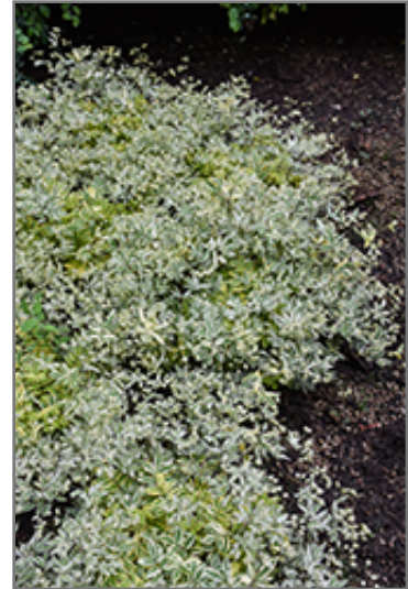
Golden Feathers Jacob's Ladder foliage

Golden Feathers Jacob's Ladder is recommended for the following landscape applications;