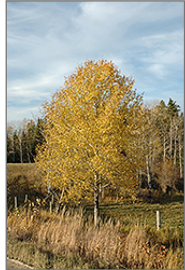
Trembling Aspen in fall

This tree should only be grown in full sunlight. It is an amazingly adaptable plant, tolerating both dry conditions and even some standing water. It is considered to be drought-tolerant, and thus makes an ideal choice for xeriscaping or the moisture-conserving landscape. It is not particular as to soil type or pH. It is quite intolerant of urban pollution, therefore inner city or urban streetside plantings are best avoided. This species is native to parts of North America.