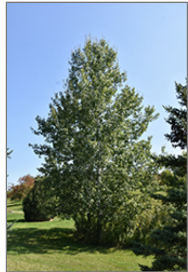
Trembling Aspen