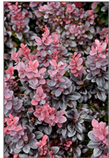
Concorde Japanese Barberry foliage