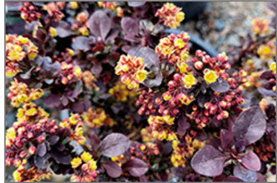
Concorde Japanese Barberry flowers

Concorde Japanese Barberry will grow to be about 18 inches tall at maturity, with a spread of 24 inches. It tends to fill out right to the ground and therefore doesn't necessarily require facer plants in front. It grows at a slow rate, and under ideal conditions can be expected to live for approximately 20 years.