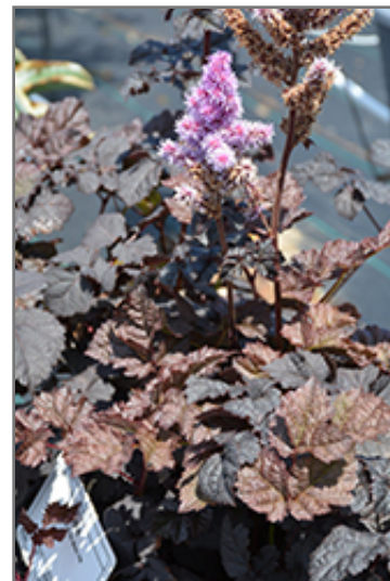
Dark Side Of The Moon Astilbe in bloom

Dark Side Of The Moon Astilbe is a fine choice for the garden, but it is also a good selection for planting in outdoor pots and containers. With its upright habit of growth, it is best suited for use as a 'thriller' in the 'spiller-thriller-filler' container combination; plant it near the center of the pot, surrounded by smaller plants and those that spill over the edges. Note that when growing plants in outdoor containers and baskets, they may require more frequent waterings than they would in the yard or garden. Be aware that in our climate, most plants cannot be expected to survive the winter if left in containers outdoors, and this plant is no exception. Contact our experts for more information on how to protect it over the winter months.