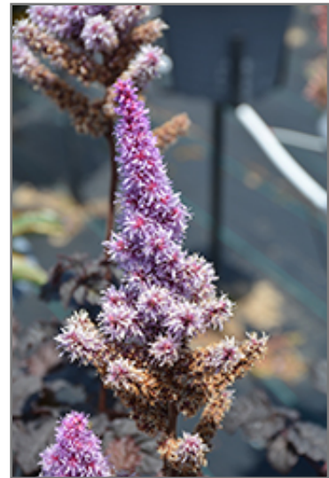
Dark Side Of The Moon Astilbe flowers

Dark Side Of The Moon Astilbe is recommended for the following landscape applications;