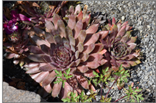
Kalinda Hens And Chicks

Kalinda Hens And Chicks is recommended for the following landscape applications;