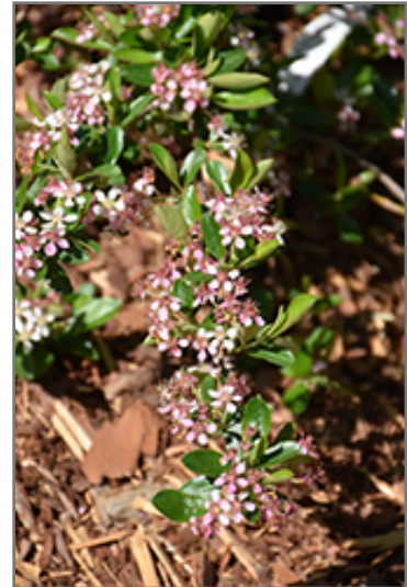
Ground Hug Aronia flowers