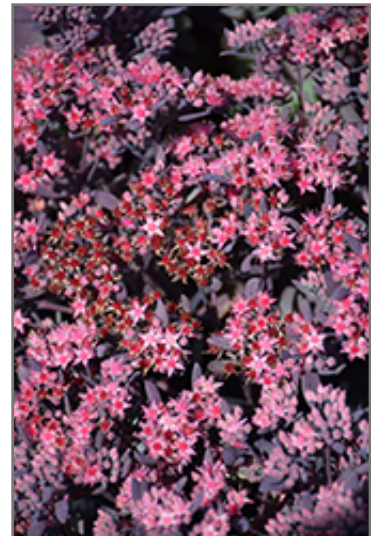
Plum Dazzled Stonecrop flowers

Plum Dazzled Stonecrop is a dense herbaceous perennial with an upright spreading habit of growth. Its medium texture blends into the garden, but can always be balanced by a couple of finer or coarser plants for an effective composition.