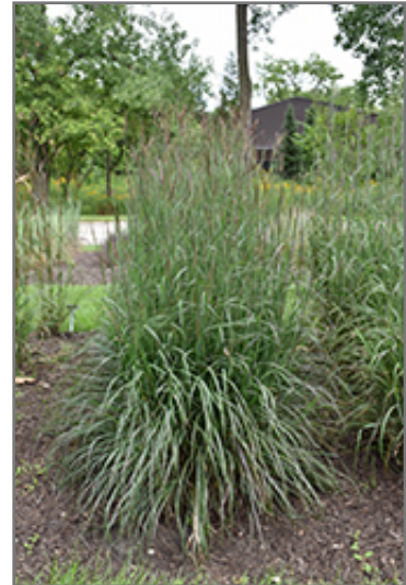
Blackhawks Bluestem in bloom