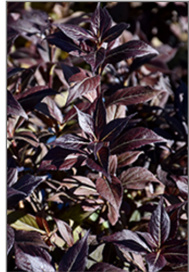
Date Night Stunner Weigela foliage