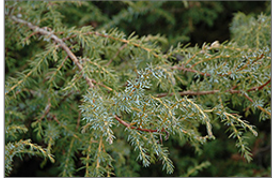
Common Juniper foliage