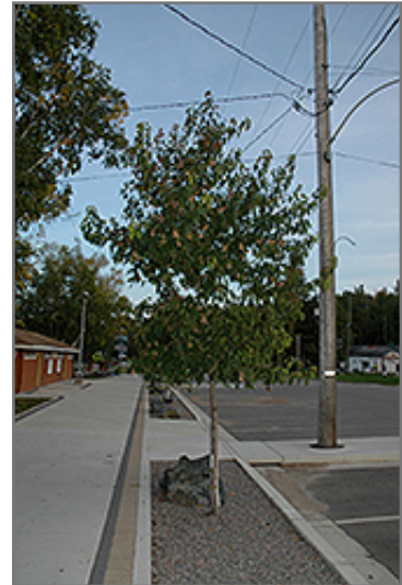
Amur Maple (tree form)