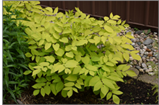
Sun King Japanese Spikenard