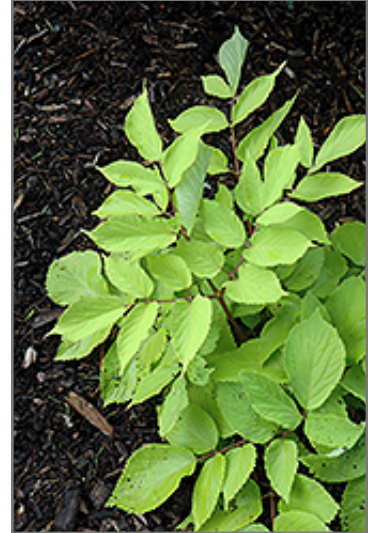
Sun King Japanese Spikenard foliage

This plant performs well in both full sun and full shade. It prefers to grow in average to moist conditions, and shouldn't be allowed to dry out. It is not particular as to soil type or pH. It is highly tolerant of urban pollution and will even thrive in inner city environments. This is a selected variety of a species not originally from North America.