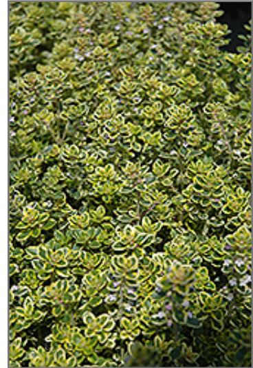
Lemon Thyme foliage

Lemon Thyme is smothered in stunning spikes of lilac purple flowers rising above the foliage from early to late summer. Its attractive tiny fragrant round leaves remain light green in colour throughout the year.