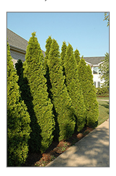
Emerald Green Arborvitae