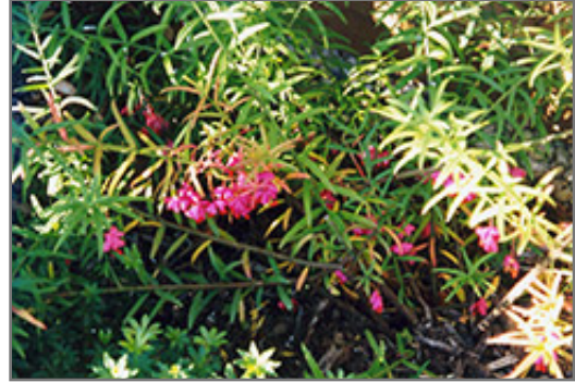
Dwarf Turkestan Burning Bush flowers

This shrub performs well in both full sun and full shade. It is very adaptable to both dry and moist locations, and should do just fine under typical garden conditions. It is not particular as to soil type or pH. It is highly tolerant of urban pollution and will even thrive in inner city environments. This is a selected variety of a species not originally from North America.