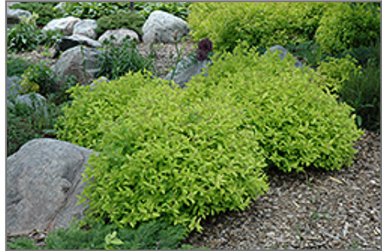
Goldmound Spirea