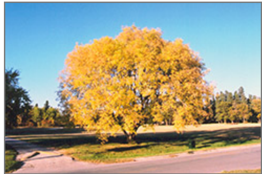
Boxelder in fall