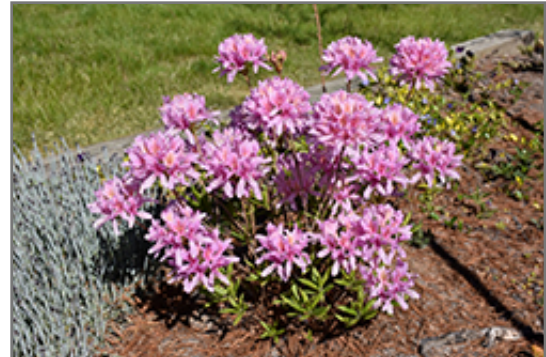
Orchid Lights Azalea in bloom