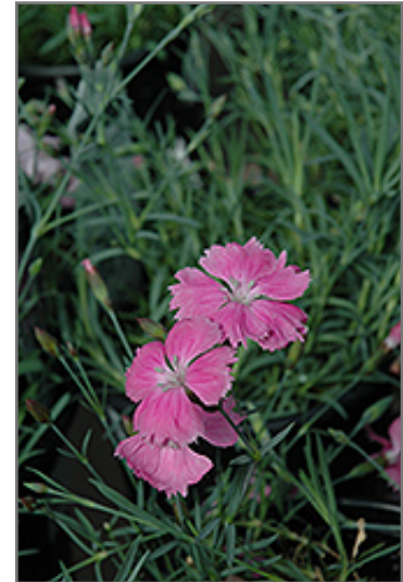
Sweetness Pinks flowers