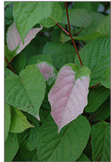
September Sun Kiwi foliage

September Sun Kiwi is recommended for the following landscape applications;