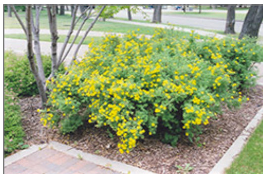
Coronation Triumph Potentilla in bloom