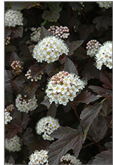
Diablo Ninebark flowers

Diablo Ninebark is recommended for the following landscape applications;