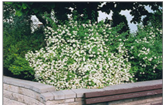
Galahad Mockorange in bloom