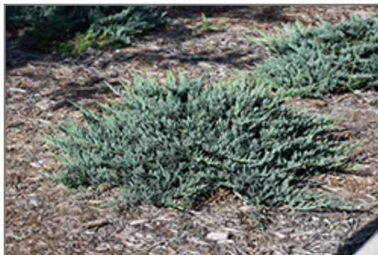
Blue Chip Juniper