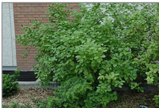
Siberian Dogwood