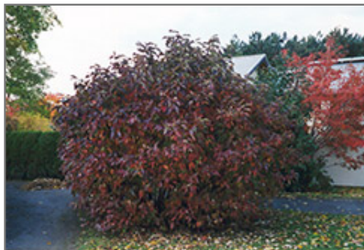
Siberian Dogwood in fall

This shrub does best in full sun to partial shade. It is an amazingly adaptable plant, tolerating both dry conditions and even some standing water. It is not particular as to soil type or pH. It is highly tolerant of urban pollution and will even thrive in inner city environments. This is a selected variety of a species not originally from North America.