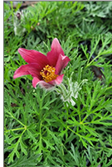
Red Pasqueflower flowers