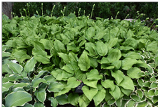
Royal Standard Hosta

Royal Standard Hosta is recommended for the following landscape applications;