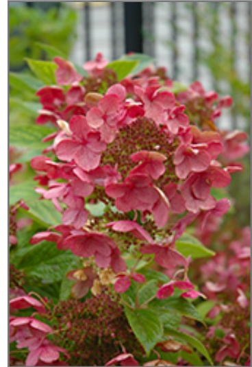
Quick Fire Hydrangea flowers (faded)

This shrub performs well in both full sun and full shade. It prefers to grow in average to moist conditions, and shouldn't be allowed to dry out. It is not particular as to soil type or pH. It is highly tolerant of urban pollution and will even thrive in inner city environments. Consider applying a thick mulch around the root zone in winter to protect it in exposed locations or colder microclimates. This is a selected variety of a species not originally from North America.