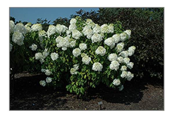
Phantom Hydrangea in bloom

Phantom Hydrangea will grow to be about 10 feet tall at maturity, with a spread of 10 feet. It tends to be a little leggy, with a typical clearance of 2 feet from the ground, and is suitable for planting under power lines. It grows at a medium rate, and under ideal conditions can be expected to live for 40 years or more.