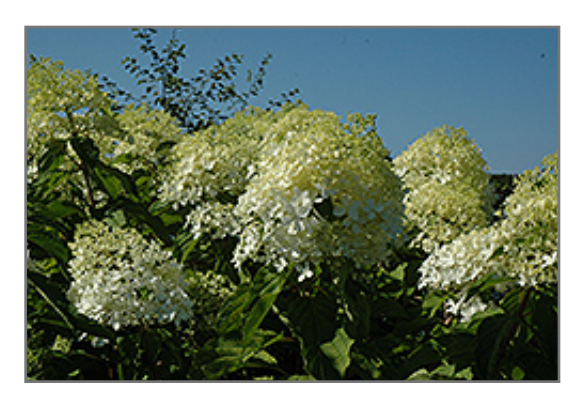
Phantom Hydrangea flowers