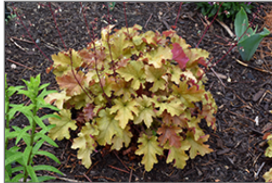
Marmalade Coral Bells