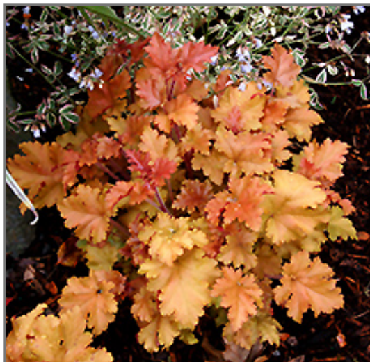
Marmalade Coral Bells foliage

Marmalade Coral Bells will grow to be about 8 inches tall at maturity extending to 18 inches tall with the flowers, with a spread of 16 inches. When grown in masses or used as a bedding plant, individual plants should be spaced approximately 14 inches apart. Its foliage tends to remain low and dense right to the ground. It grows at a medium rate, and under ideal conditions can be expected to live for approximately 10 years. As an evergreen perennial, this plant will typically keep its form and foliage year-round.