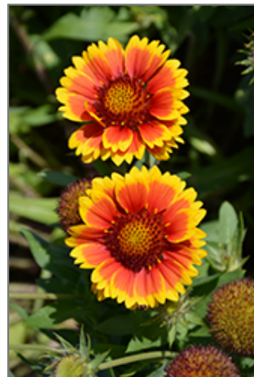
Arizona Sun Blanket Flower flowers

Arizona Sun Blanket Flower is recommended for the following landscape applications;