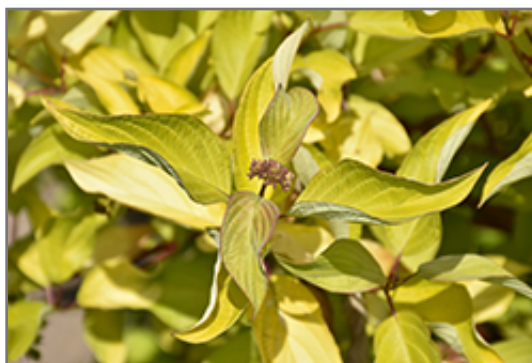
Morden Amber Dogwood foliage