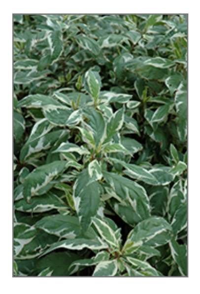
Cream Cracker Dogwood foliage

Cream Cracker Dogwood is a multi-stemmed deciduous shrub with a more or less rounded form. Its average texture blends into the landscape, but can be balanced by one or two finer or coarser trees or shrubs for an effective composition.