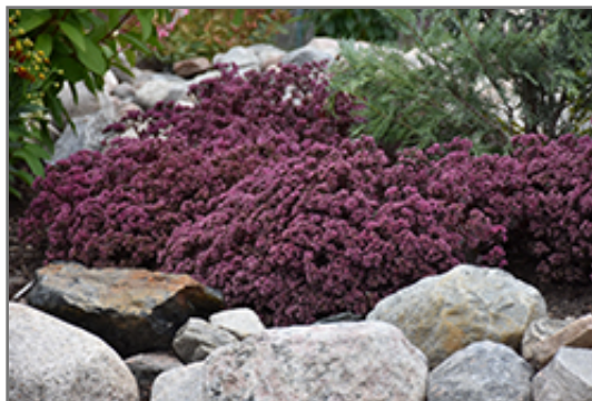
Cherry Tart Stonecrop in bloom

Cherry Tart Stonecrop is a dense herbaceous perennial with an upright spreading habit of growth. Its medium texture blends into the garden, but can always be balanced by a couple of finer or coarser plants for an effective composition.