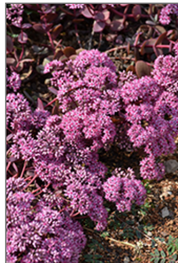
Cherry Tart Stonecrop flowers

This plant is not reliably hardy in our region, and certain restrictions may apply; contact the store for more information.