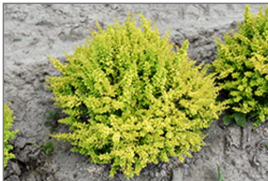
Sunsation Japanese Barberry

Sunsation Japanese Barberry is recommended for the following landscape applications;